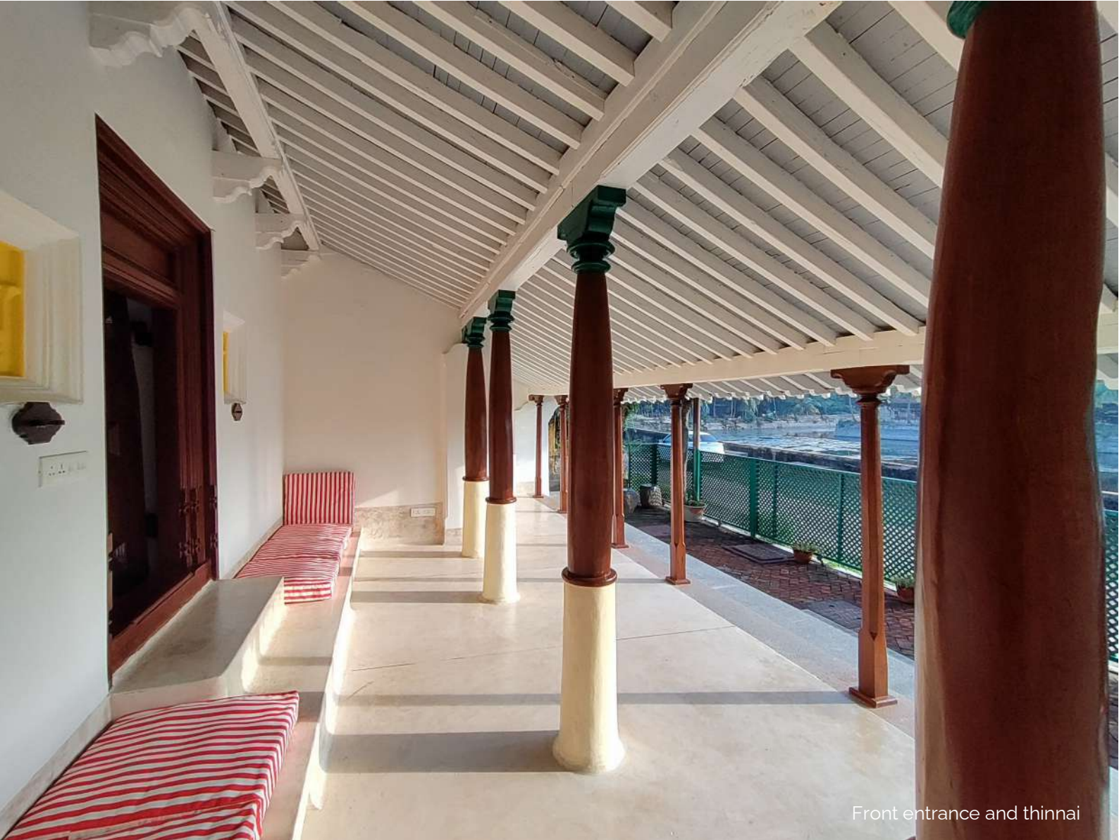
Front entrance and thinnai