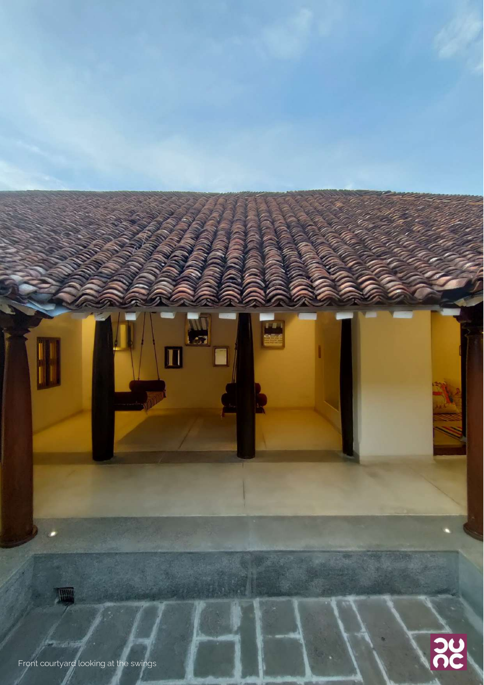
Front courtyard looking at the swings