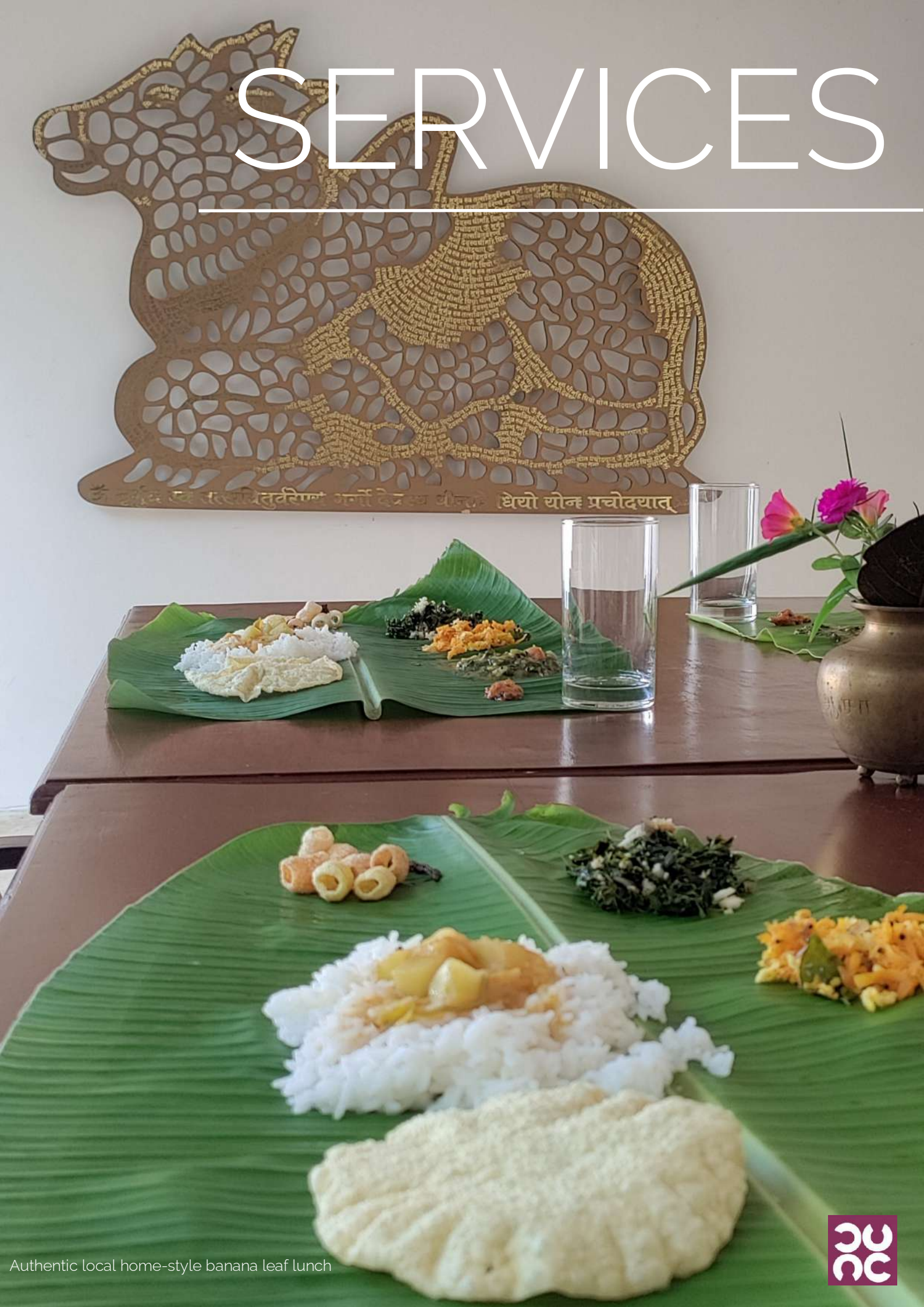
Authentic local home-style banana leaf lunch