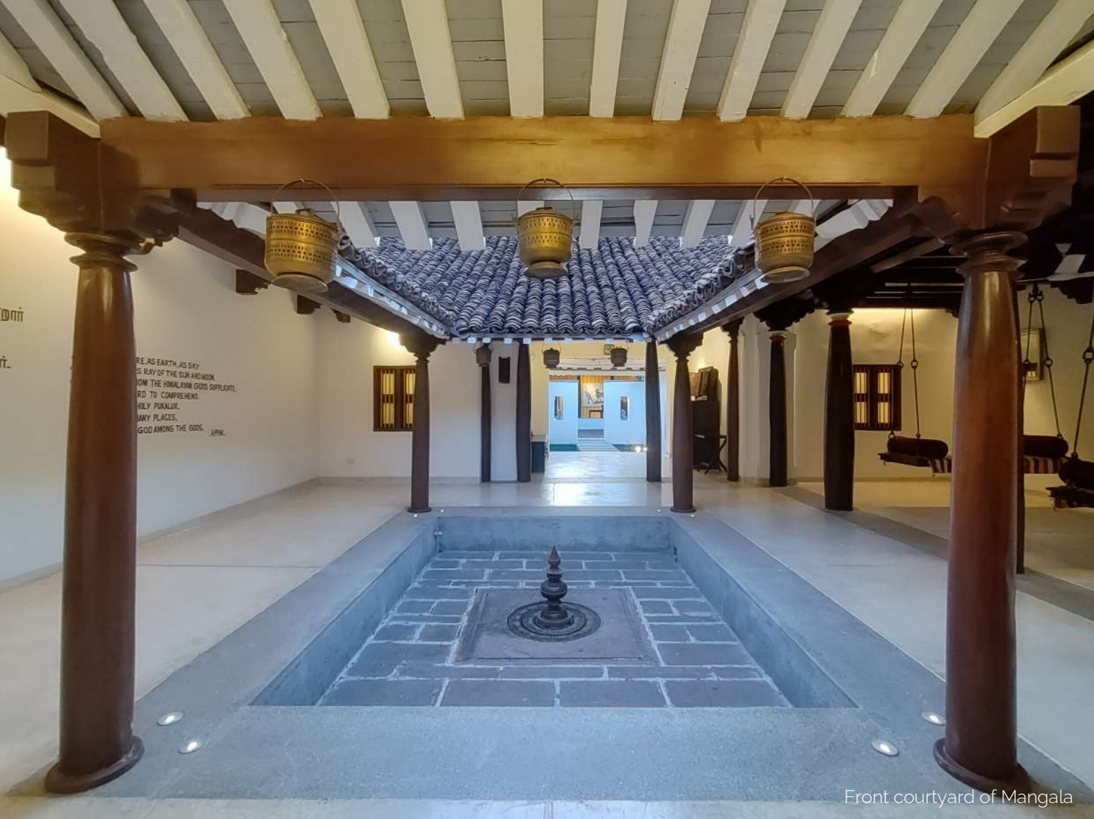
Front courtyard of Mangala