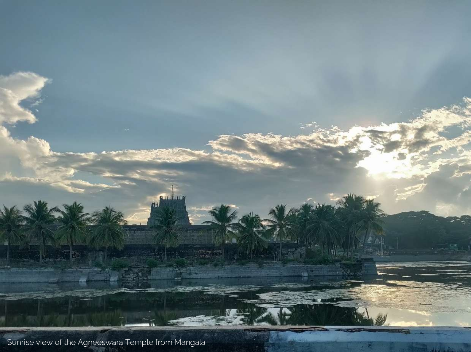
Sunrise view of the Agneeswara Temple from Mangala