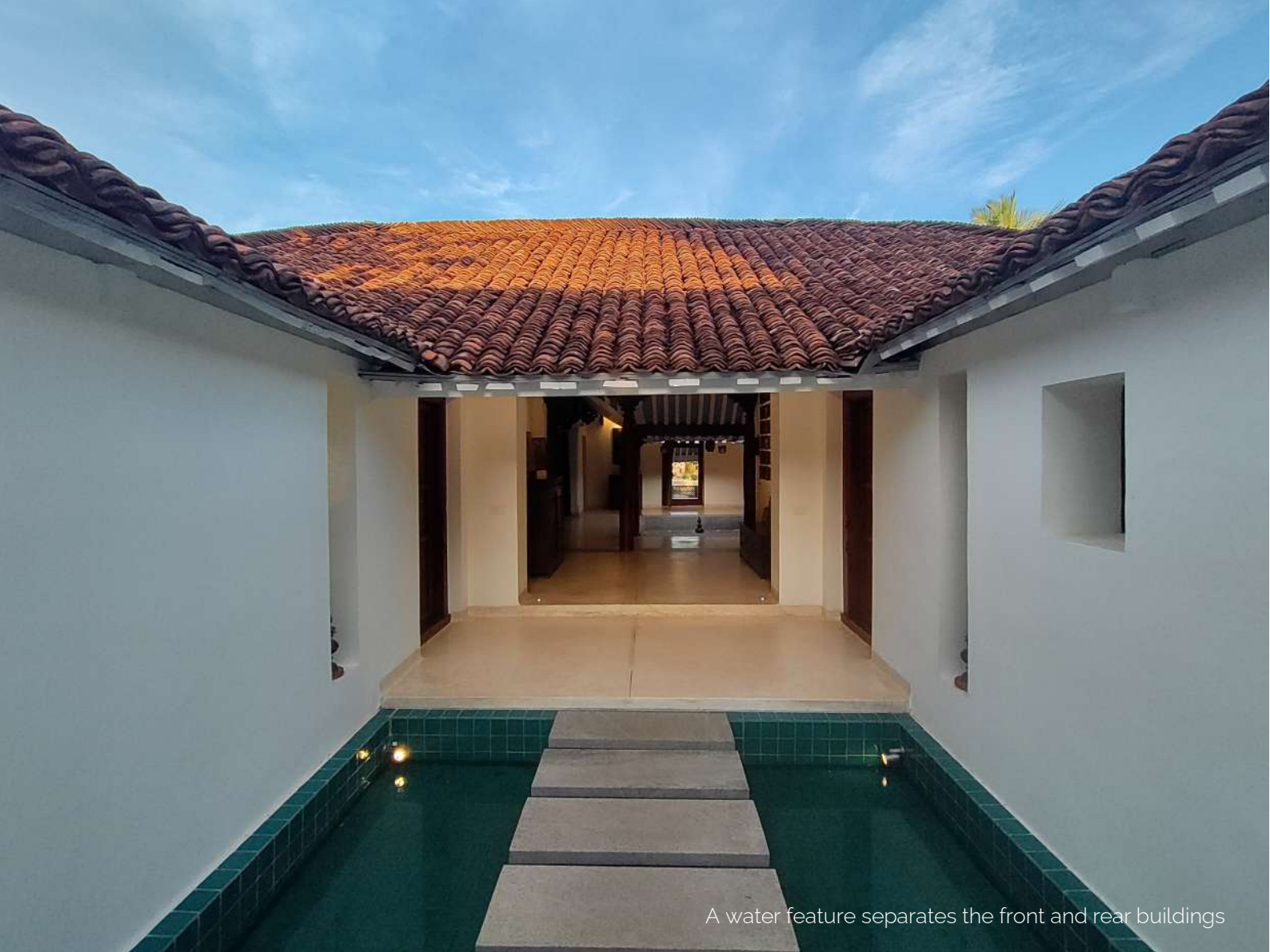
A water feature separates the front and rear buildings