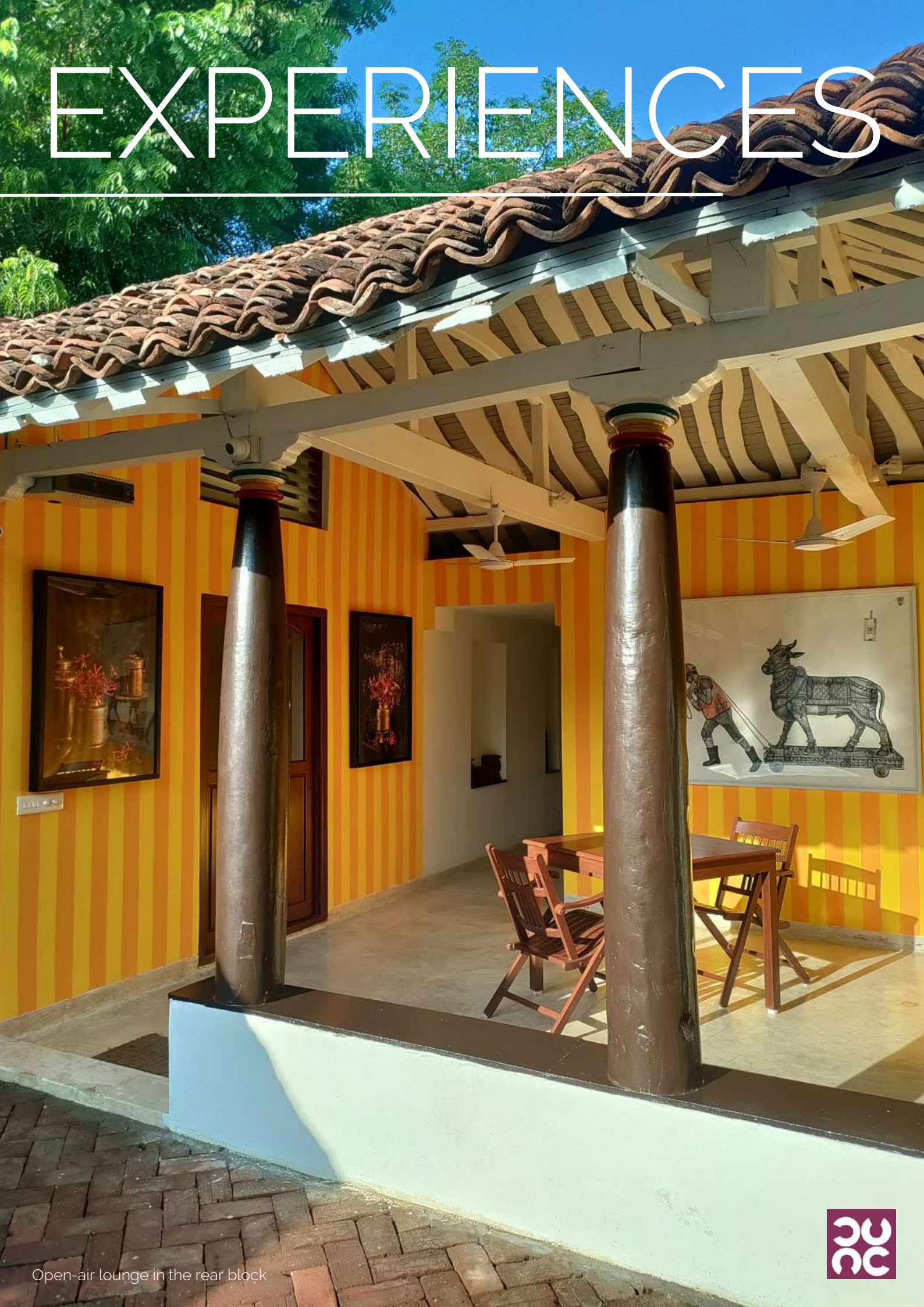
Open-air lounge in the rear block